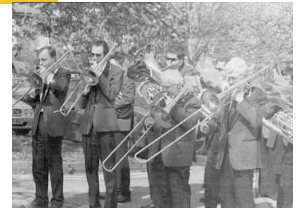
The trombone section made their way into the Brighouse Courier on Monday 25th of April.