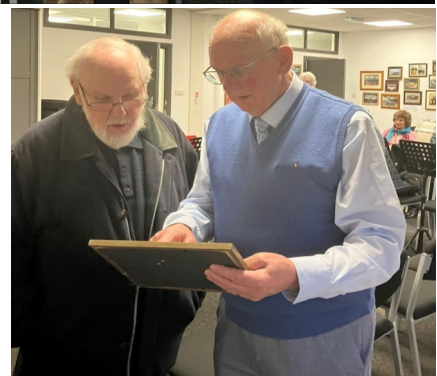
A selection of photographs with some of our guests on the open day